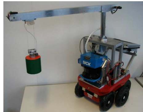
Fig. 1. The Kurt3D robot with magnetic crane manipulator.

This research is funded by the European Commission’s 6th Framework Programme IST Project MACS [16] under contract/grant number FP6-004381. The Commission’s support is gratefully acknowledged.